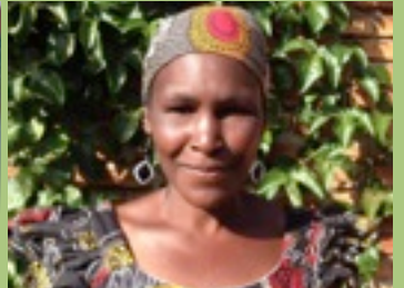
A Joint Mission Project of Watertown and Canton First Presbyterian Churches