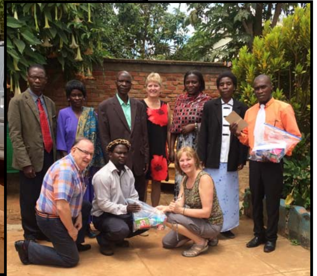
The teachers were anxious to share what is working well from their Keys to Education training and what they need next.